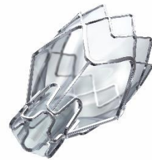
Zephyr Valve.